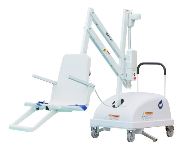
PAL Hi/Lo—For in-ground pools and raised spas.

Aquatic activities benefit people of all ages and abilities, and our comprehensive line of pool access equipment helps ensure every water enthusiast can get in and out of the pool safely. All S.R.Smith pool lifts are constructed with powder-coated stainless steel and aluminum and have integrated arm rests.