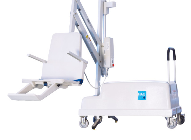
PAL2—Portable Aquatic Lift