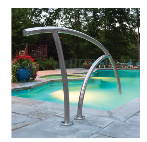
Ask about our complete range of ladders & rails including safety and stair rails.

Email us at info-au@srsmith.com for more information, or visit www.srsmith.com/au